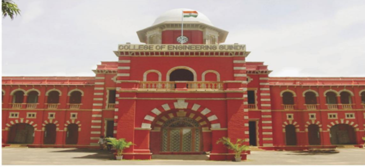
College of Engineering, Guindy Campus

Addendum to the Notification No.001/RC/UD-FR/PR10&20/2020-2, dated 30.09.2020