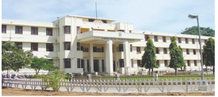
Alagappa College of Technology Campus