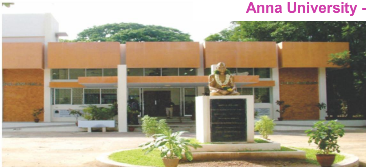
Madras Institute of Technology Campus