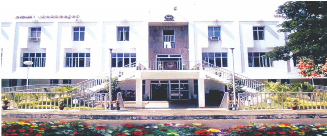
Anna University - Administrative Block