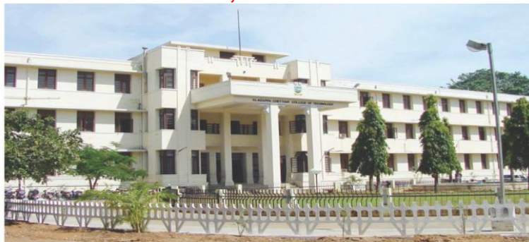
Alagappa College of Technology Campus