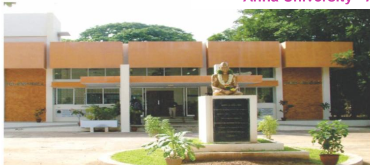
Madras Institute of Technology Campus