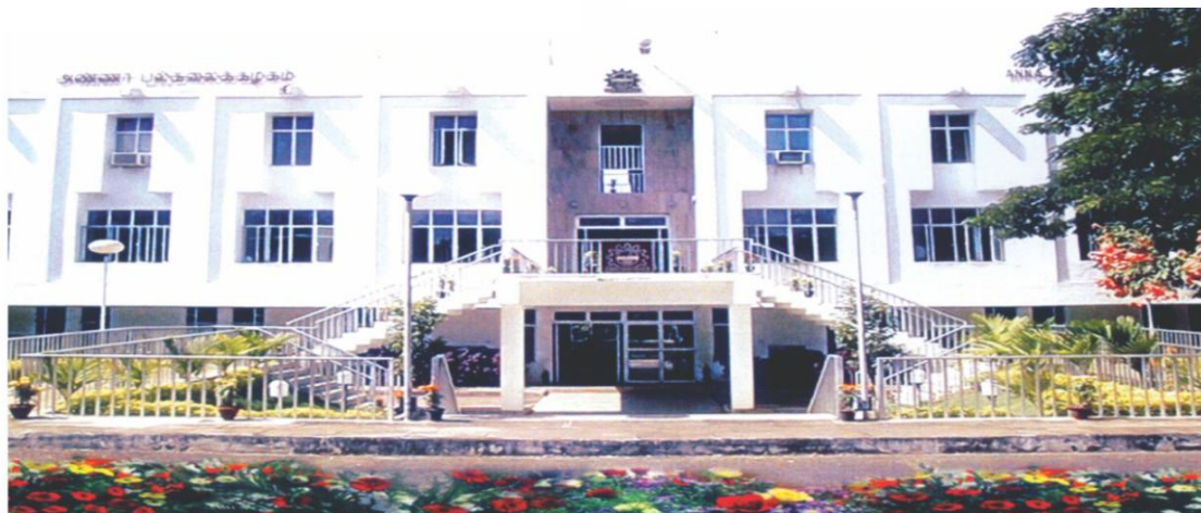
Anna University - Administrative Block